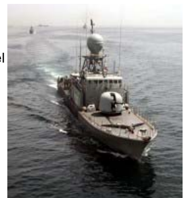
An Iranian warship takes part in a naval parade in 2006.

The two ships will cross into the Mediterranean Sea on their way to Syria. Defense officials said that Israel would track the ships but that their presence in the sea would not change anything for the Navy's operational deployment.