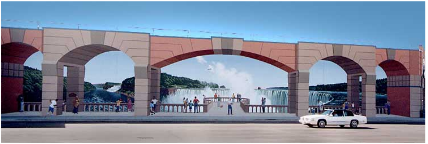
After - close-up