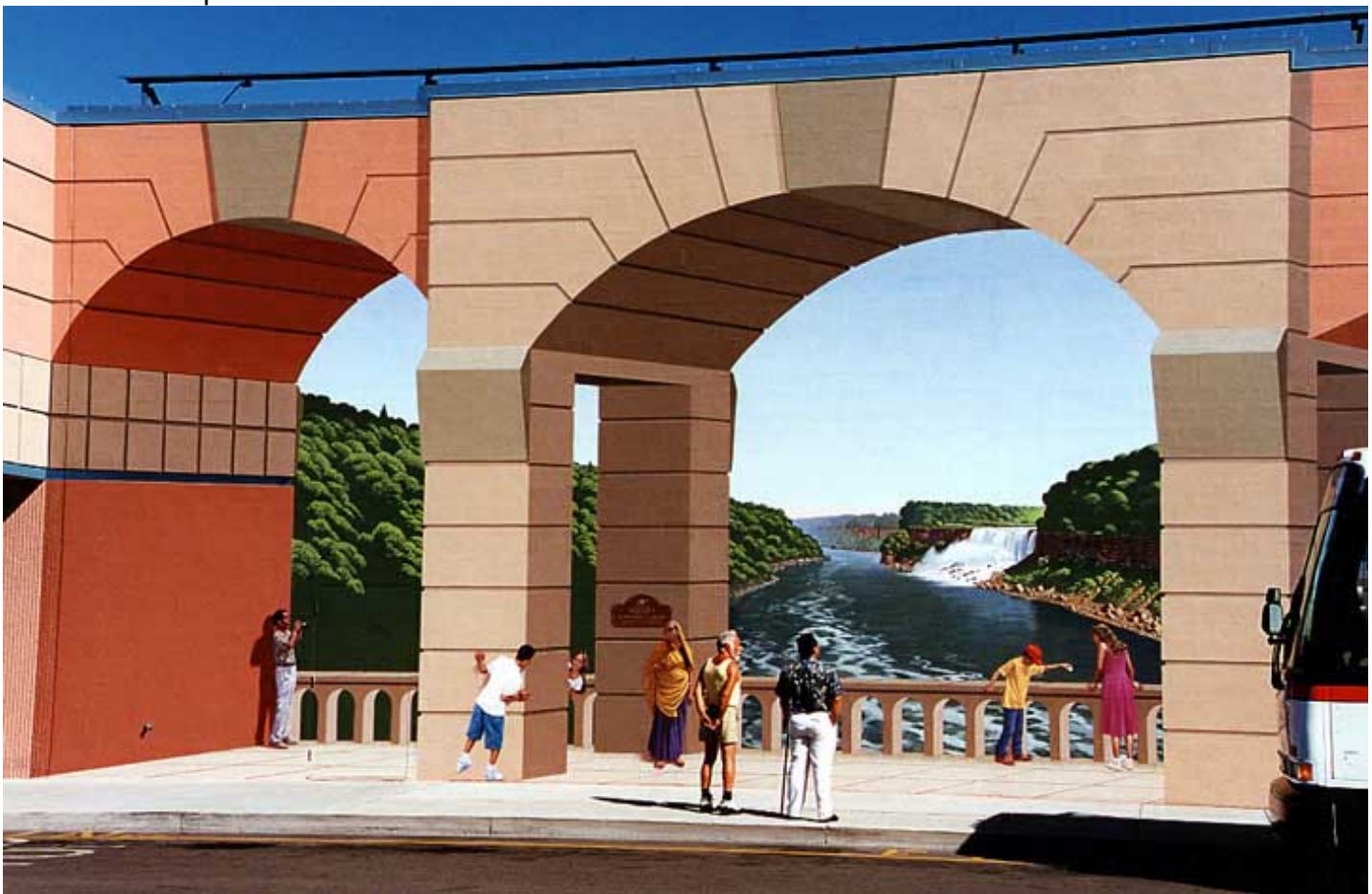
The other side