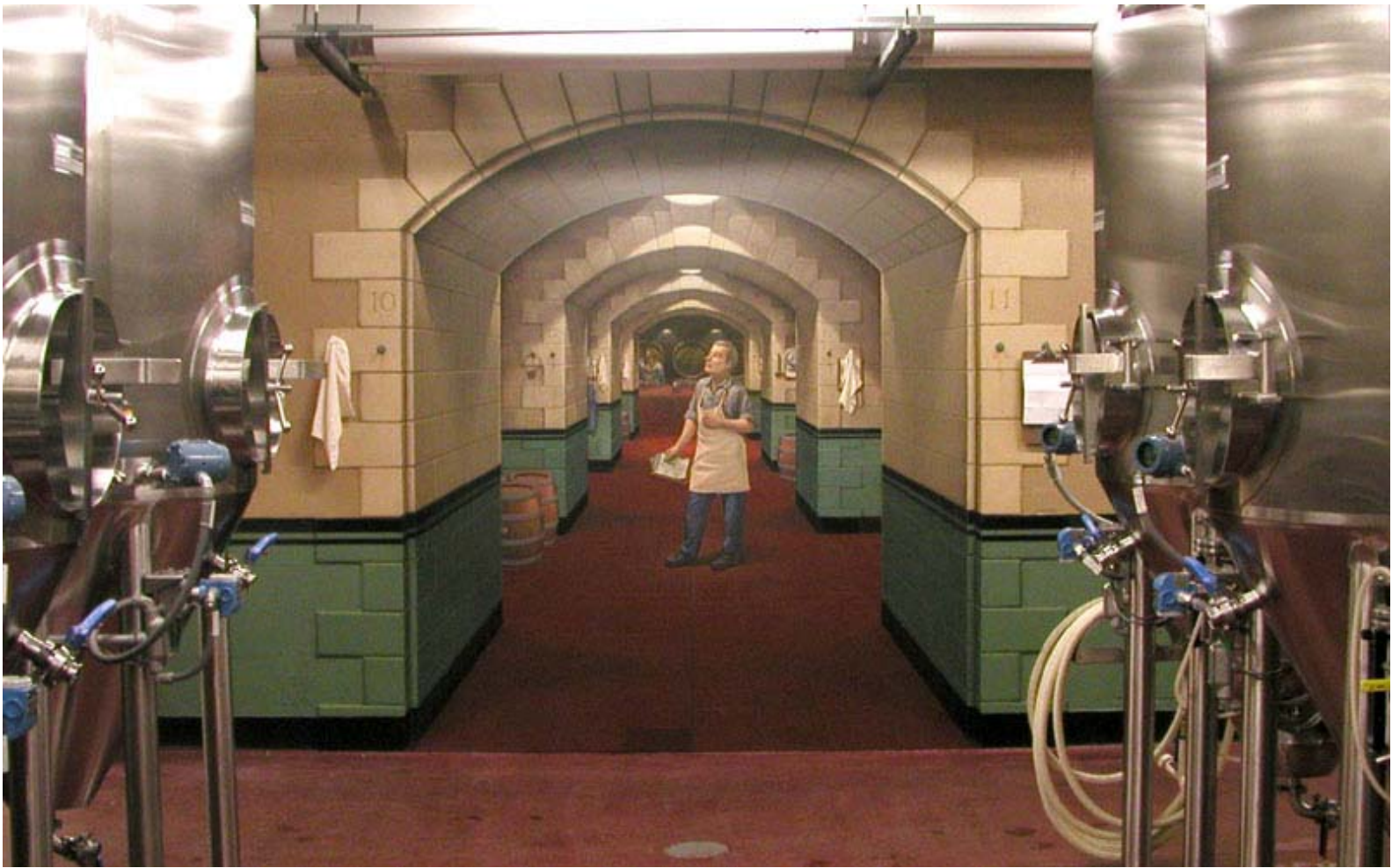
After Photos - Past meets Present in the Miller Brewery Fermenting Rooms - hooks, clipboards and aprons were added to the surface of the murals to enhance the illusion. You're looking at flat walls!