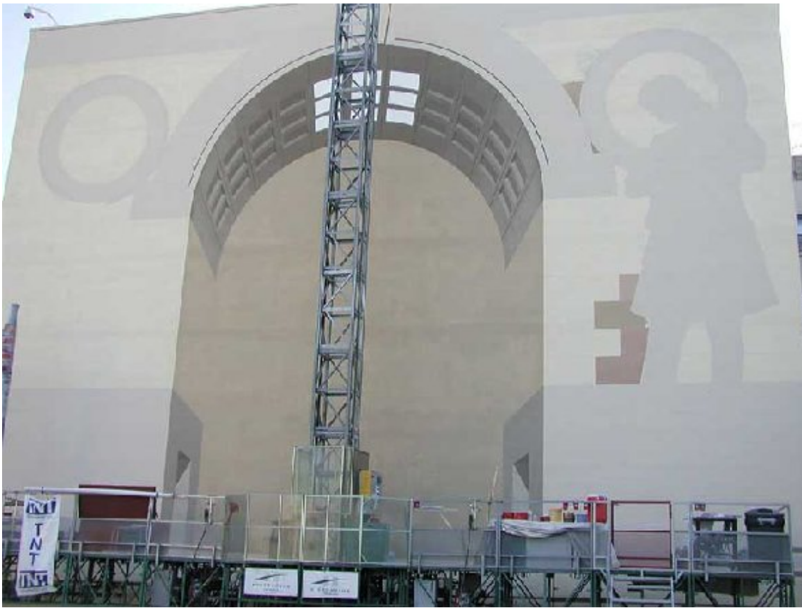
The wall starts to take on a 3-dimensional appearance