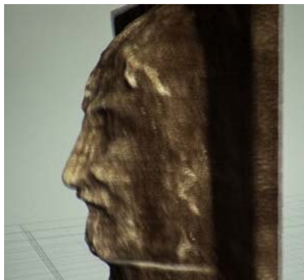
Profile of shroud image

In recreating the face of Christ, Downing was confronted with a greater challenge, as the shroud of Turin contains a faint image of a crucified man.