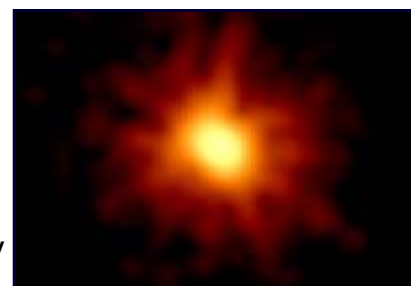
NASA says the afterglow of a 2008 gamma ray burst in the Bo-otes constellation is the most intrinsically bright object ever observed by humans in the universe. (Click for larger image)

NASA said the afterglow "was 2.5 million times more luminous than the most luminous supernova ever recorded, making it the most intrinsically bright object ever observed by humans in the universe. "