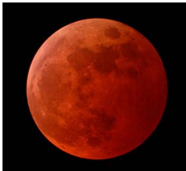
Total lunar eclipses often make the moon appear red

He says during this century, tetrads occur at least six times, but what's interesting is that the only string of four consecutive blood moons that coincide with God's holy days of Passover in the spring and the autumn's Feast of Tabernacles (also called Succoth) occurs between 2014 and 2015 on today's Gregorian calendar .