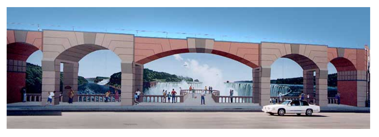
After - close-up