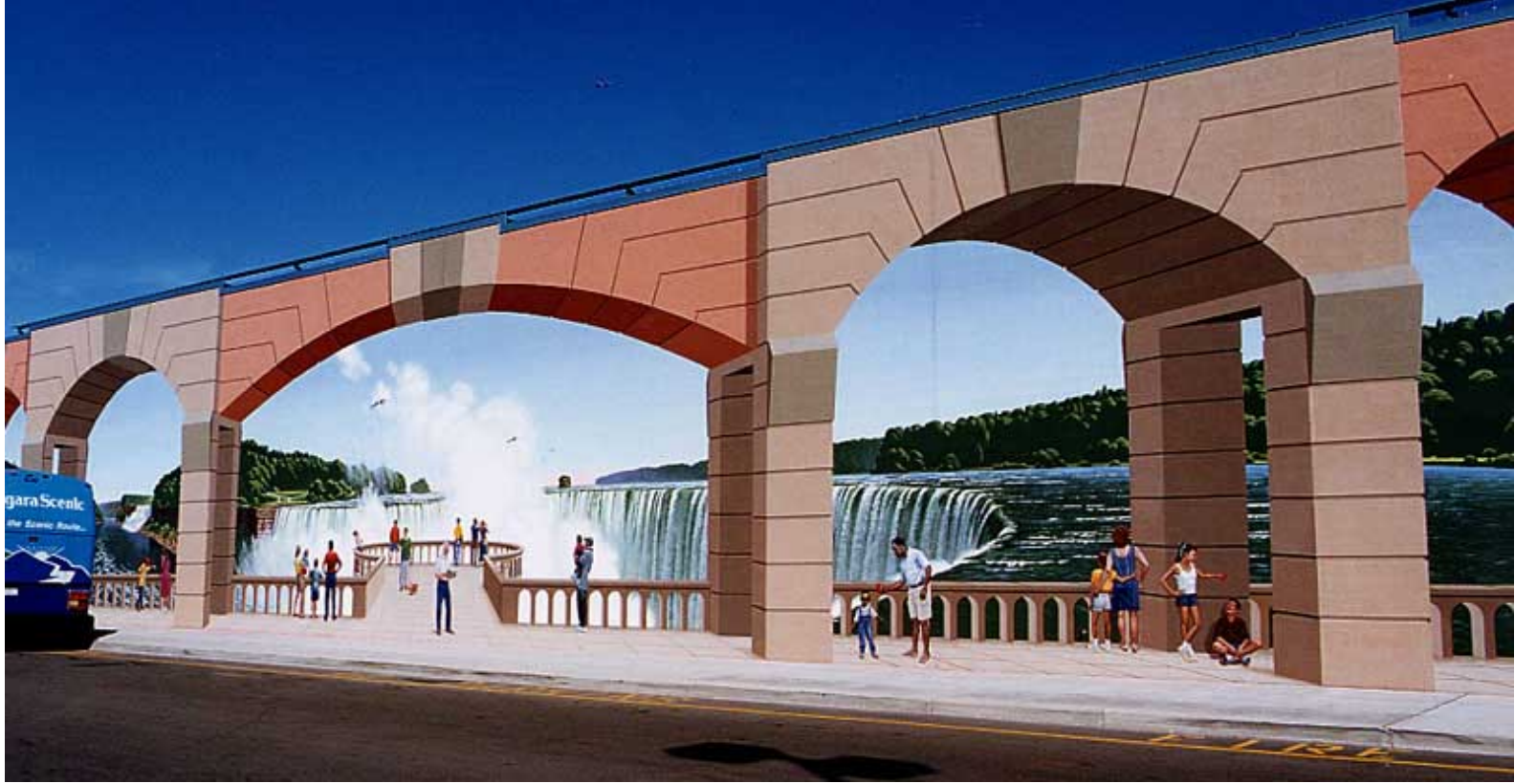
After (I wonder how many birds fly into this wall on a daily basis?)