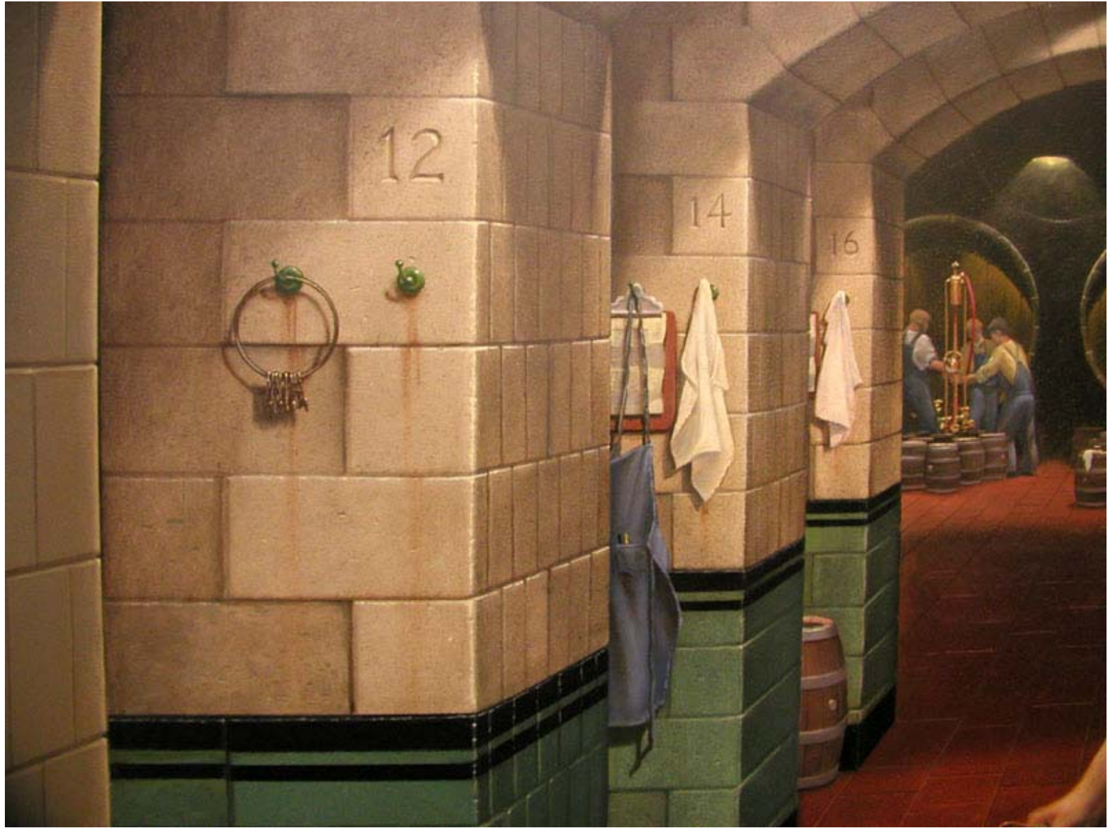
Detail view looking down the illusional hallway in the previous mural.