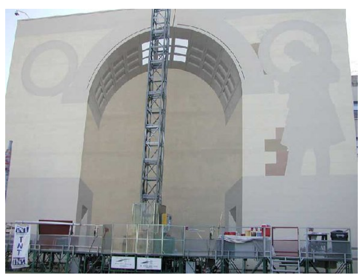
The wall starts to take on a 3-dimensional appearance