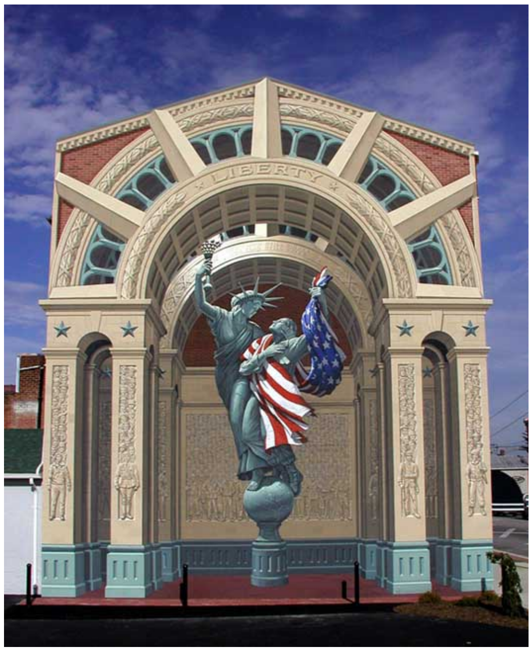
After - hard to believe you're looking at a flat 2-dimensional wall