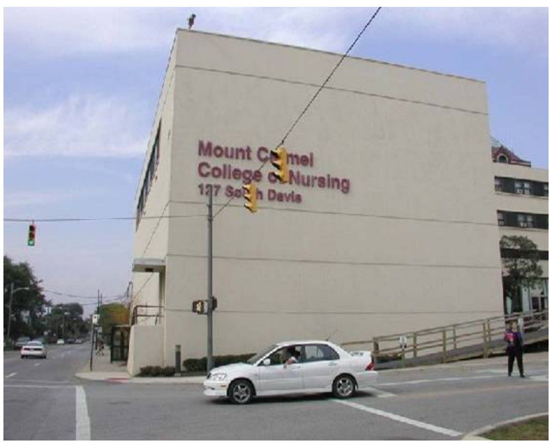
Before photo - typical concrete & stucco facade

Eric Grohe is an artist of large life-like murals. He turns walls into works of art. The scale, realism and attention to detail are incredible.